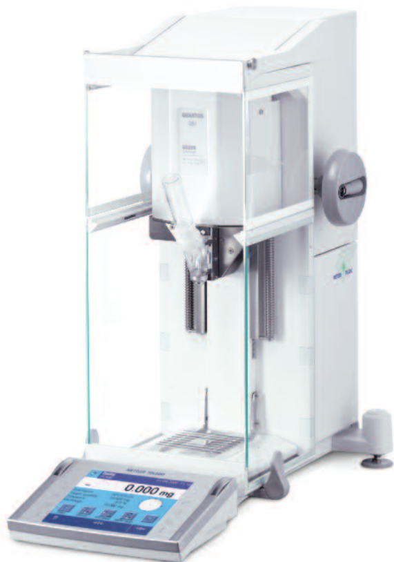
Mettler-Toledo's Quantos uses disposable dispensing heads that eliminate the need for sterilization and cleaning solvents. Each dispensing head includes an RFID chip that controls dosing and stores data.

The company offers auto-samplers that hold 15 or 30 capsules size 3 and larger, thereby converting the Quantos from a one-to-one oper-