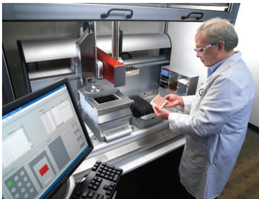
Symyx's Powdernium is a multipurpose robotic platform that can dose from one or many sources to one or many destinations. It comes with a variety of accessories to suit the micro-dosing task.

Symyx Technologies, Sunnyvale, CA. Tel. 732 918 0455 www.symyx.com